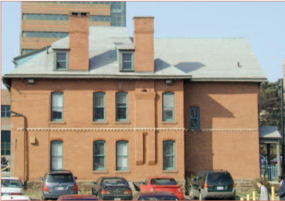
The building located at 47 Sigourney Street will be moved to its new home at 21 Ashley Street in July, 2004.

The long-awaited move of 47 Sigourney Street to a new location at 21 Ashley Street is now targeted for July, 2004. Once relocated, the building will become a single-family house. If everything goes as planned, the move will represent a major collaborative success for the Northside Institutions Neighborhood Alliance (NINA), the City of Hartford, the Asylum Hill NRZ and HPA.