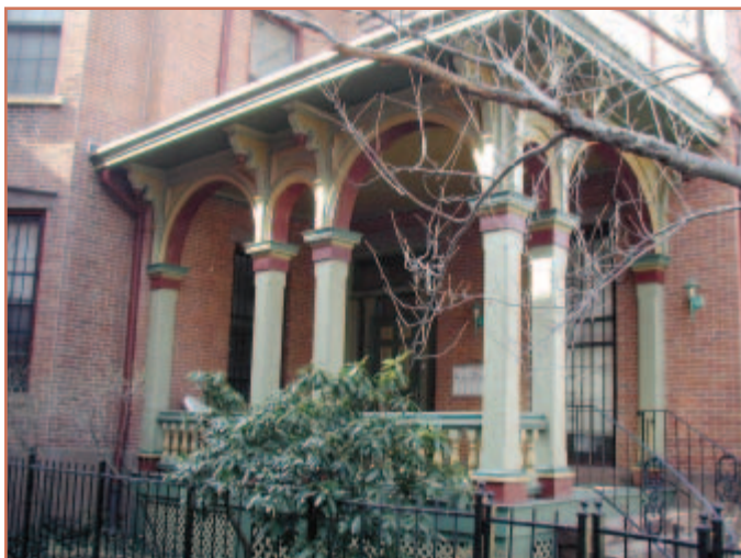
The 1865 Nathaniel Shipman house, site of HPA's 2003 holiday party.

The year 2003 was also a year in which preservation gained significant traction in Hartford. The Hartford Courant led the way with a regular series of articles on "Place." The City of Hartford started work on a preservation