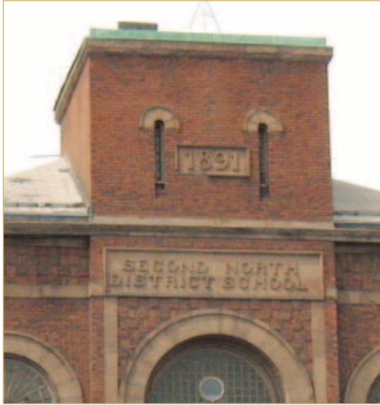
Detail of the former Board of Education Building.