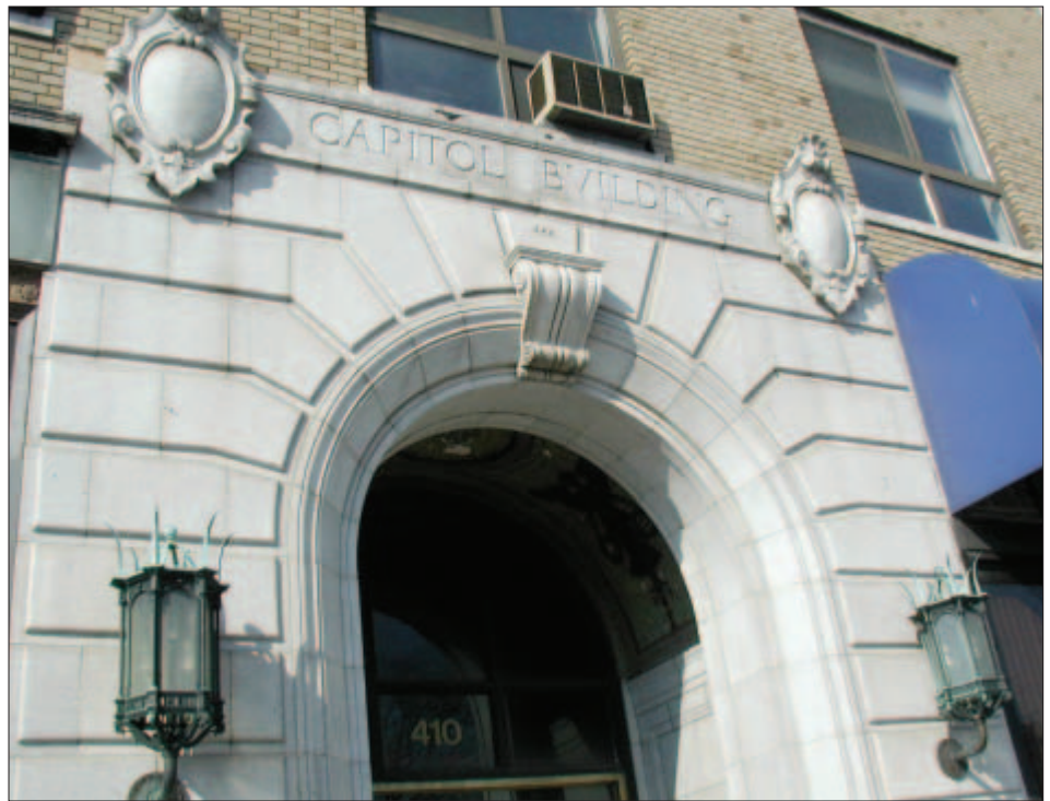
Entryway to 410 Asylum Street, also known as the Capitol Building.

For more information, contact Rafie Podolsky at 860-232-7748, rpodolsky@hartfordpreservation.org.