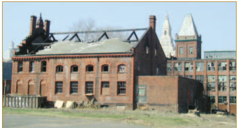
View of former Capewell Horse Nail Company administration building on Governor Street, showing fire-damaged roof.