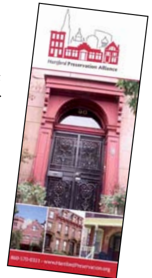
HPA's new brochure.

There are 3,505,000 residents in Connecticut, 121,600 of which live in the Capital City. The Hartford Preservation Alliance proudly serves all stakeholders.