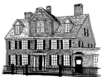
396 MAIN STREET ~ 1782

The mission of the Hartford Preservation Alliance is to preserve and revitalize Hartford's unique architectural heritage and neighborhood character.