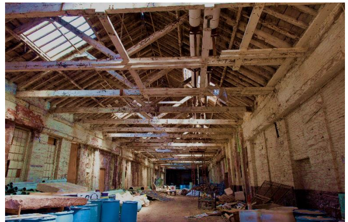
Interior of one of the forge/foundry buildings

entire project will take several years so it is important to responsibly mothball the structures. This emergency stabilization work will ensure there is no more deterioration and that the buildings are not safety hazards. This will be followed up by a larger report that will recommend specific long-term preservation strategies and provide “Class C” estimates for the cost of the larger project. With this information in hand the NPS will understand what needs to be done and how much it will cost. We can then work to acquire the money needed to complete the project.