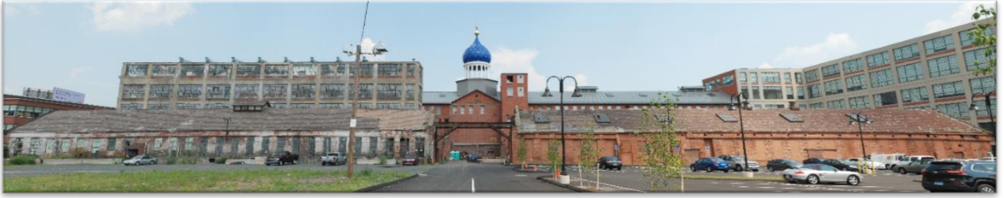
Forge and foundry buildings below and flanking the onion dome.